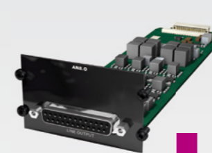
AN8.O 8 ch line output