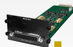
MIC8.HD.I 8 ch mic high density input