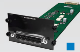
AES4.SRC.IO 4 port AES3 input with SRC / output