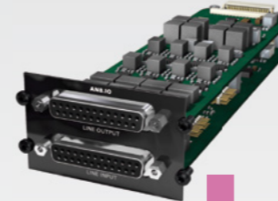
AN8.IO 8 ch line input / output