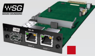
SG.IO Waves SoundGrid