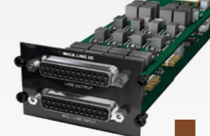
MIC8.LINE.IO 8 ch mic input / line output