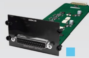
AES4.IO 4 port AES3 input / output